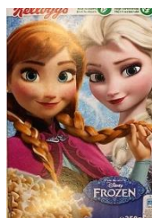
Disney's Elsa (Frozen)