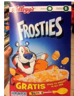
Example 3 Kellogg's Frosties' 'Tony the Tiger'