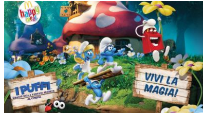
Italy: McDonald's 'Happy' and The Smurfs (Altroconsumo)