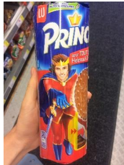
Example 1 Lu Biscuits' 'Prince'