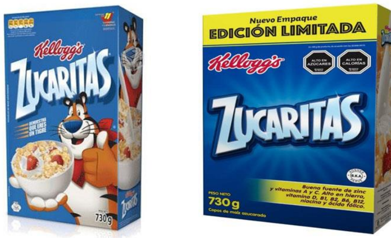
Figure 2 Before and After Implementation of the Law.

The Chilean government took a strong stance and announced fines for non-compliance in November 2016 20 . It was a swift response to the three food companies (Nestlé, Kellogg's and Masterfoods, the distributor of Mars' M+Ms in the country) who refused to remove their brand mascots on products which failed to meet the requisite nutritional criteria.