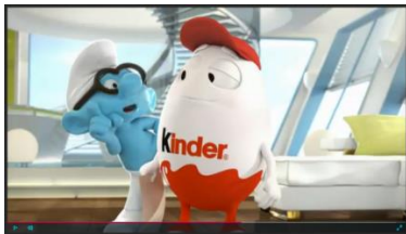
Switzerland: Kinder and The Smurfs (FRC)