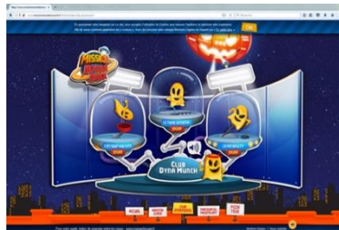
France: Monster Munch (UFC Que Choisir)

Research has shown that characters can influence diet-related behaviours of children, especially with regard to energy-dense and nutrient-poor foods 17 . Their use should be restricted to healthy produce to encourage young children to increase their consumption of fruit and vegetables for example.