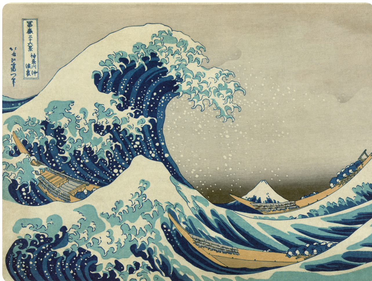
The Great Wave off Kanagawa, Wikimedia Commons: https://upload.wikimedia.org/wikipedia/commons/0/0d/Great_Wave_off_Kanagawa2.jpg

more concentrated 10 , and display lower levels of investment in innovation. 11